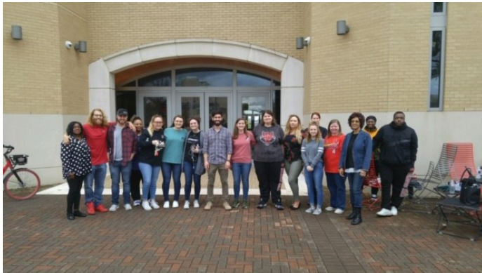
The CSG Club toured Grimes and MacPherson prisons.